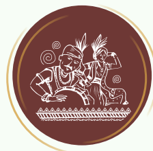
Art & Culture Programmes