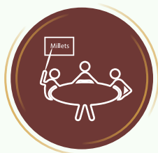
Policy Round Table