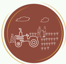
Machinery & Technology Demonstration