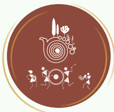
International Millet Food Festival