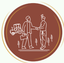
Engaging Session for Farmers